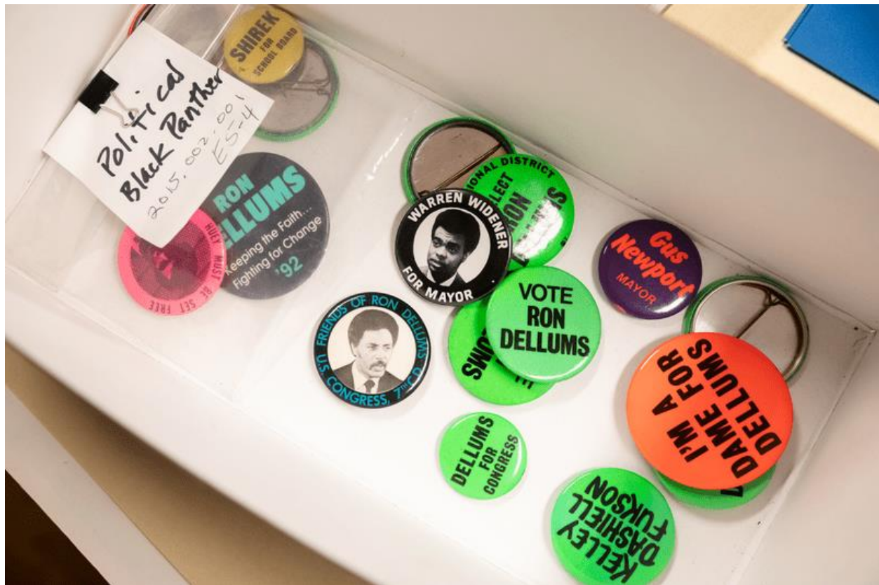
Buttons of influential political figures in Berkeley’s history are displayed at the “African Americans in Berkeley’s History and Legacy” exhibit.